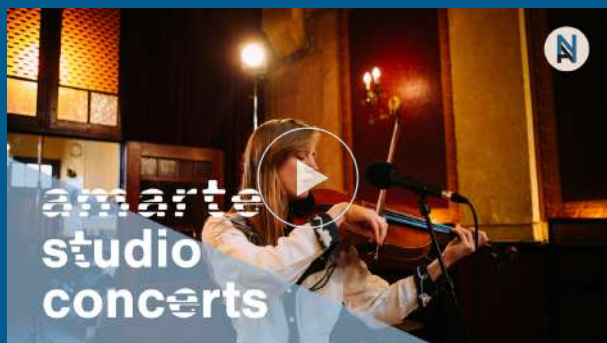
Watch Albertine here .